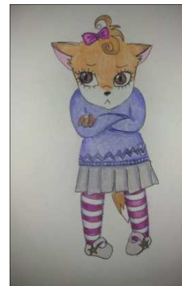
Figure 1. Focus Group Stimulus Material Depicting Caricature of a Child with Incarcerated Parent by Rhythm Bowers, Graphic Illustrator.

The predominant source for recruiting was a community center in the Washington D.C. area. The remainder of the focus groups were held in Maryland, D.C., and Virginia. The focus group size averaged about 5 people. The follow-up focus groups and make-up sessions were conducted via online meeting software.